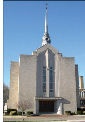
Left: St. Peter's Catholic Church, 112 Church St. (1949)