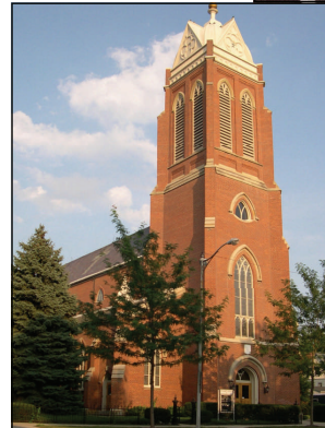
Left: St. Mary's Catholic Church (1869), 61 S. Paint St.